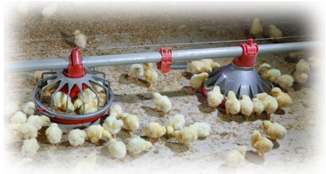
Three Days Old