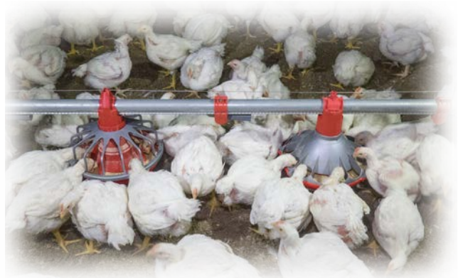
39 Days Old

Adolescent birds may still climb inside grilled feeders. They block access to feed for other birds and contaminate the feed with their droppings.