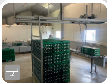
Installation mounted on the ceiling

Using daily to the full satisfaction of poultry farmers around the world.